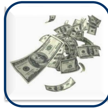
U.S. Financial Costs $72+ Billion/Year