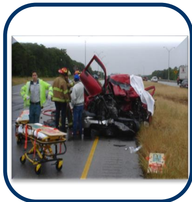
Drugged Driving Injury