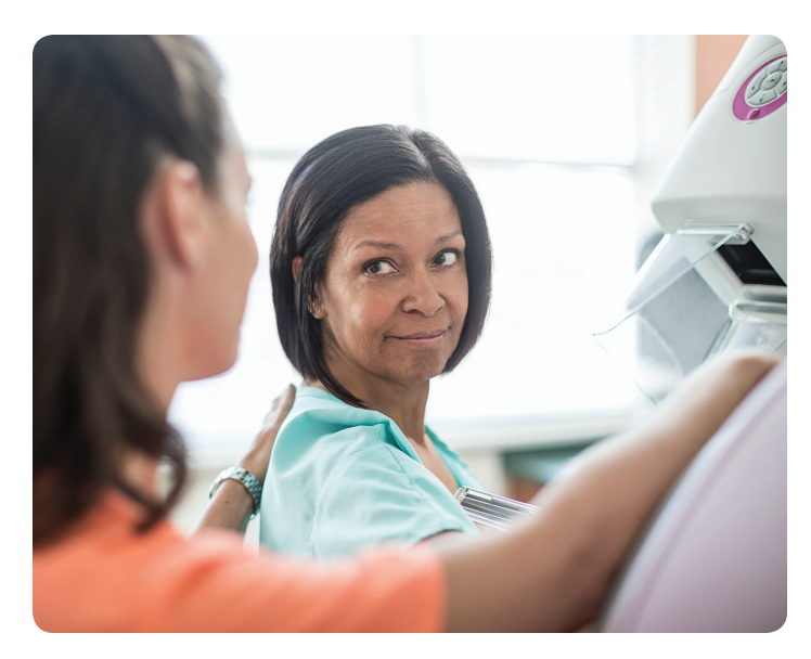
Call your doctor to schedule your mammogram appointment today.

Does it hurt? Mammograms can be a little uncomfortable but the test only takes a few minutes. An over-the-counter pain reliever may help.